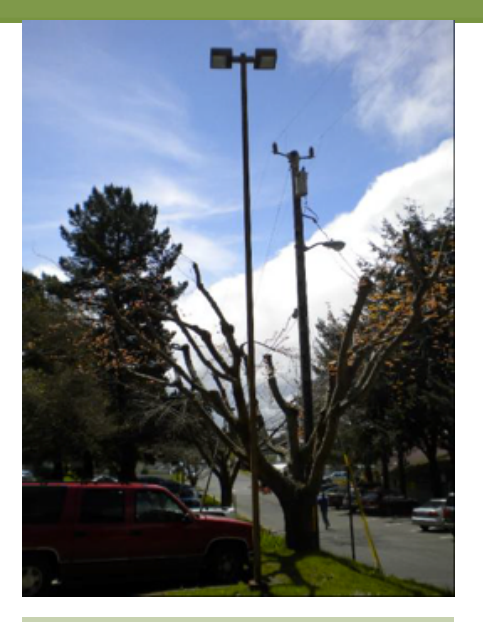
The existing High Pressure Sodium pole in 14th Street Lot

marketplace and are quickly surpassing Compact Fluorescent Lights (CFL) as the preferred technology. The bi-level lighting system uses motion sensors that will decrease the light output when there is no movement for an extended period of time.