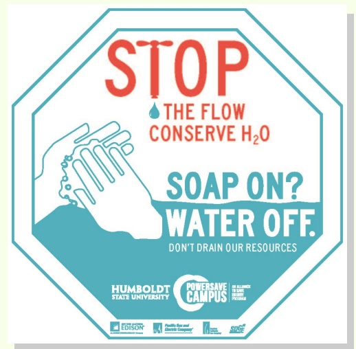
RIGHT: Water Conservation Sticker

After presenting this class project at the UC Santa Cruz PowerSave Campus Summit in February, we have received interest from other PowerSave Campus teams to implement this sticker on their campuses as well. We are going to freely distribute the design (without the HSU logo) so look out for the water conservation sticker at UC San Diego, CSU San Bernardino, and some of the K-12 PowerSave Schools in California sometime this year!