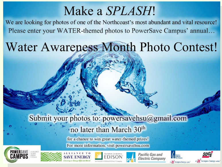
ABOVE: WAM Photo Contest Flyer

This event is especially important because of the current state drought emergency. Governor Brown urges California residents to reduce their water consumption by 20% to address the low levels of reservoirs and rainfall experienced in the last year. We hope that this event will heighten awareness about the drought and increase conservation efforts on campus and at home.