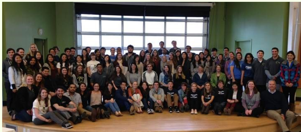
ABOVE: PowerSave Campus Summit attendees